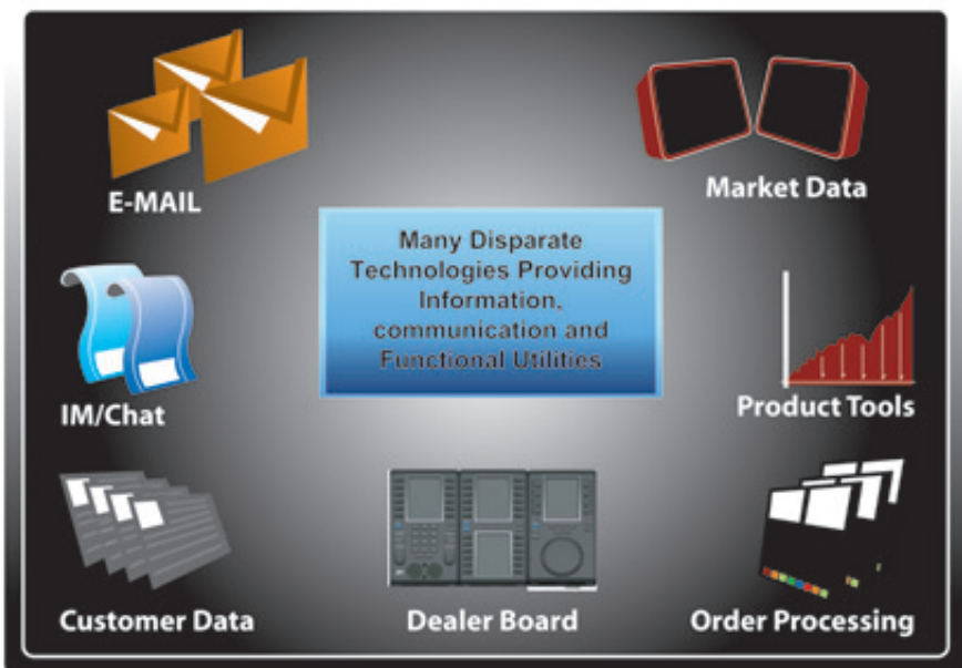
The evolving trading environment